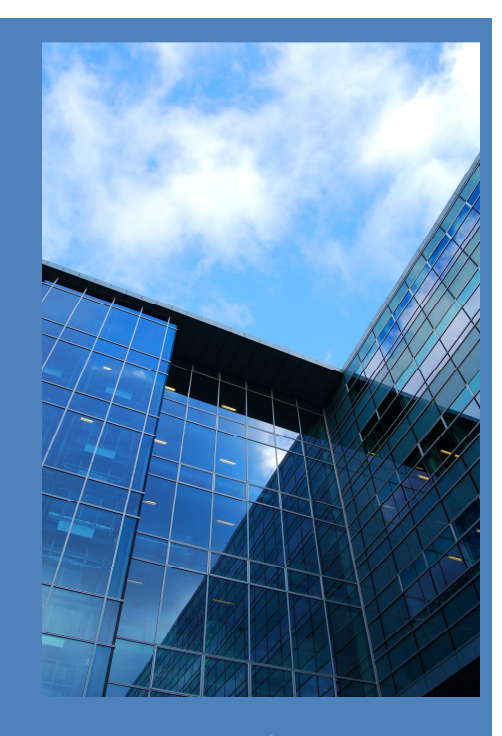
The IT University of Copenhagen in Denmark is a state-funded University, dedicated to teaching and research in Information Technology. The IT University of Copenhagen is situated between DR and Copenhagen University in Ørestad, a new district in Copenhagen.