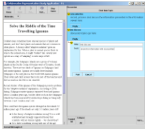
Figure 1. “Text” environment

condition for testing the above hypotheses, since the workspace only provides explicit support for representation of discussion structure (subject headings and reply relations).