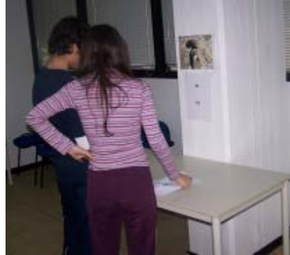
Fig. 6. The participants in the pilot study during the execution of the electronic game.

The first user evaluation revealed some usability problems, such as the absence of feedback in case of system delay. This is a particularly important aspect when interacting in a mobile context. We have therefore improved the system by sending visual and sound messages that warn the user about what is happening. In addition, we introduced the possibility to undo previously performed actions.