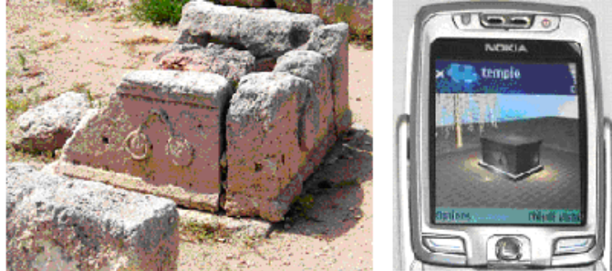
Fig. 3. The remains of the temple (left) and a phone 3D reconstruction of how it probably looked two thousands years ago (right).

and the whole school class is encouraged to participate and collaborate.