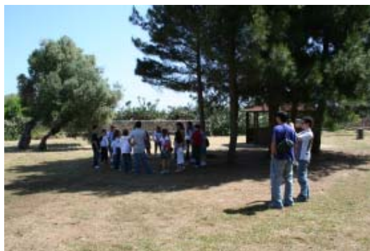
Fig. 1. Students listening to the game master at the archaeological park.

We made use of the contextual inquiry technique to collect data about users' own activities [2, 7]. We participated in an actual excursion-game performed at Egnathia by students (11-12 years old) of the middle school "Michelangelo" in Bari, Italy. The pictures shown in the paper were taken during that visit.