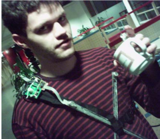
Fig. 2. A first version of a fully mobile Magic Touch system based on ultrasonic hand tracking and RFID-based identification of physical objects.

As future activities we plan to perform ethnographical studies for determining what objects human agents typically encounter throughout the day. We also plan to perform lab-experiments for determining qualities of physical and virtual objects useful for designing Physical-Virtual Artefacts, objects with both physical and virtual manifestations [2].