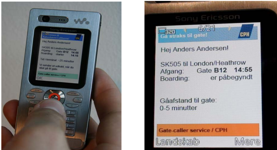
Fig. 3. The basic Gatecaller system informing passengers on when to go to gate, dependent on their current location. The picture to the right shows the message sent automatically when boarding has started to a passenger who has not yet shown up at the gate.

The design purpose of SPOPOS Gatecaller service is to reduce uncertainty that passengers experience and make them less liable to miss their flight. Airport operators will have fewer departures delayed due to missing passengers and, in the long run, more relaxed and satisfied passengers.