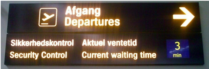
Fig. 2. Tracking of Bluetooth mobile phones provides real-time information to passengers and security managers on waiting time. The information is also published at the airport's webpage.

Increased security levels in airports increase the time passengers spend waiting for inspection and passport control. A queue can build up suddenly, and some passengers may become critically late while waiting in line. The SPOPOS tracking facilities make it possible for airport management to see passenger flow and congestions in real-time, and therefore, e.g., if and when a queue is accumulating at a particular control point. In turn, this overview provides airport staff with an option to increase the manning on the control point immediately (Figure 2).