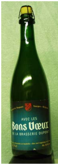
Bons Vaux – 75 cl – 9,5% – B – 1